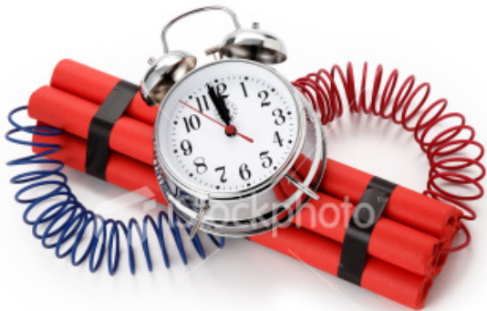
This Photo licensed under CC BY-SA